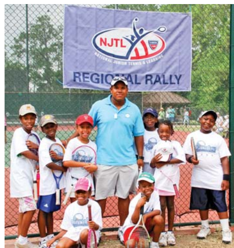
Children who attend the Zina Garrison Foundation will directly benefit from the funds received by the WHO Foundation.